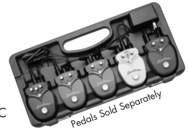
Pedals Sold Separately